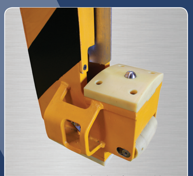
Polyurethane foot to avoid damages