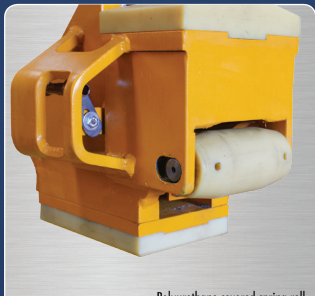
Polyurethane covered spring roll