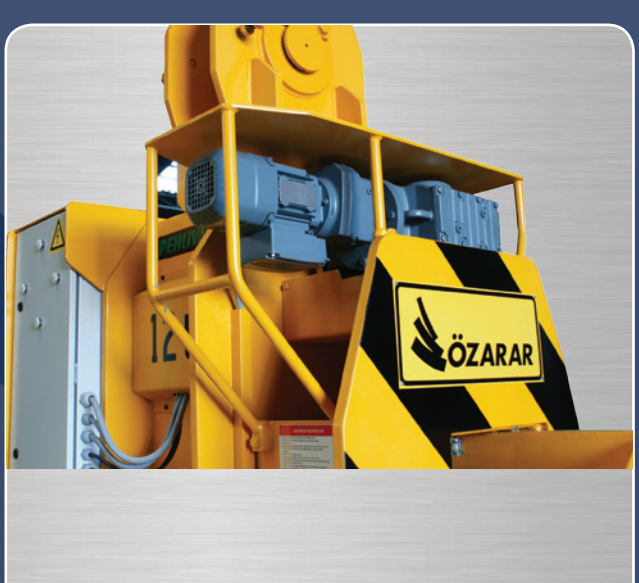
Collision-proof motor protection

Socket type linking system for convenient installation